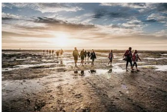
© Nordseeküste Nordfriesland | Markus Rohrbacher